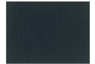
SC-173 ADMIRAL BLUE

Printed colors shown are extremely accurate to the actual colors however please request a memo sample to ensure satisfaction.