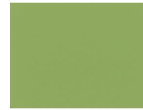
SC-120 GREEN APPLE