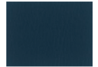
SC-177 DEEP SEA